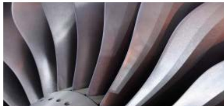
Export Controls Compliance