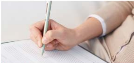
Human Research Ethics

Research at UNSW Australia is supported by clear processes for work involving humans, animals, gene technology and radiation safety, all of which are linked to research integrity and its underpinning principles. Visit the following areas to find out how your field of research is covered.