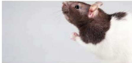
Animal Research Ethics